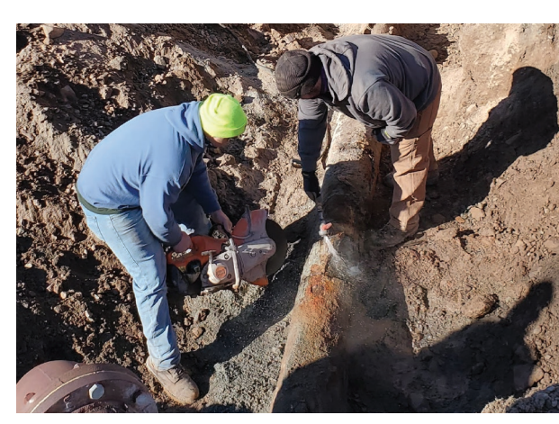
Working to remove a decades-old air pipe.