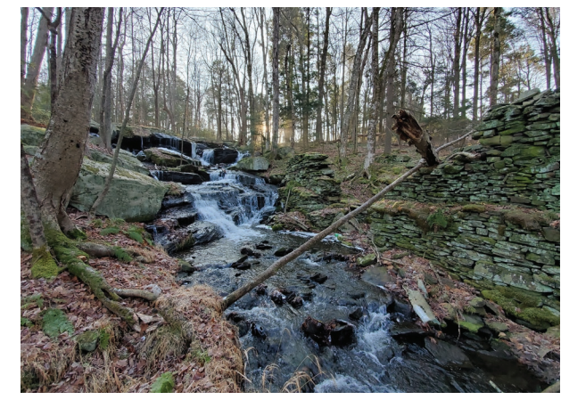
The view from the Emerald Green WWTP reminds us that these updates will protect our waterways.