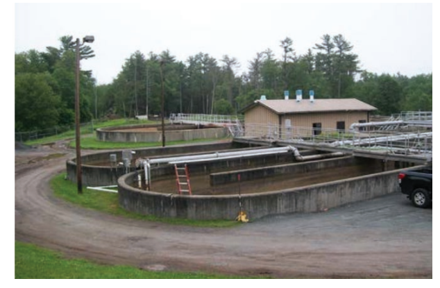
Oxidation ditches at Kiamesha Lake WWTP are in need of improvement.

Let me know if you have questions about these critical updates. Also visit <a href="https://www.thompsonSewerUpgrades.com">www.thompsonSewerUpgrades.com</a> to view detailed plans, maps, and documents.