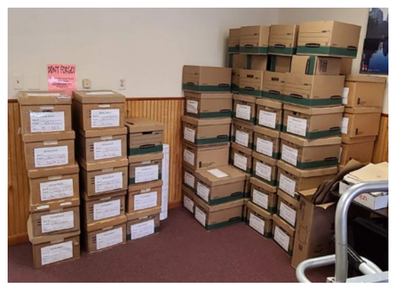
Boxes of documents are prepared to be digitally archived.