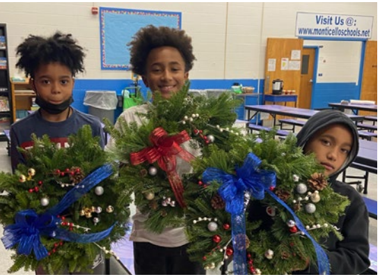
Kids had a blast making holiday wreaths at the free Winter Craft Day in December.