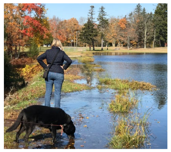
Residents got a sneak peek at the new Lake Ida Park during a free guided autumn hike.