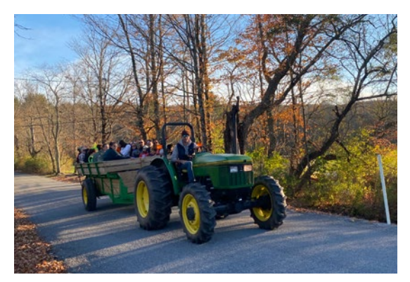
Hundreds of visitors enjoyed wagon rides at the free Treats and Trails Halloween event.