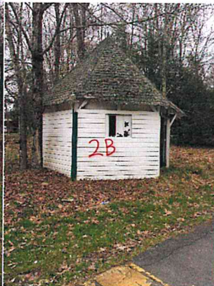
Building 2B Shack