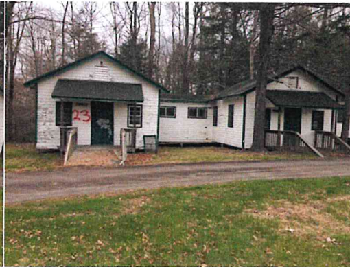
Building #23 Hopi & Huron