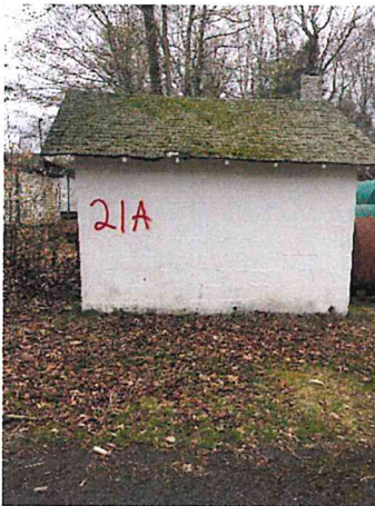
Building #21A Utility