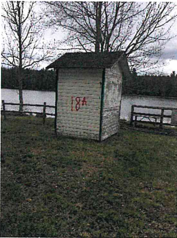
Building #18A Boat House