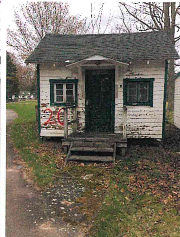
Building #20 Ottawa