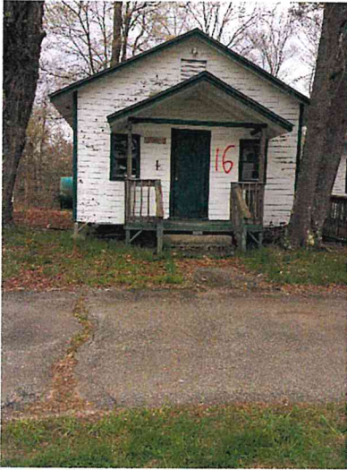
Building #16 Erie