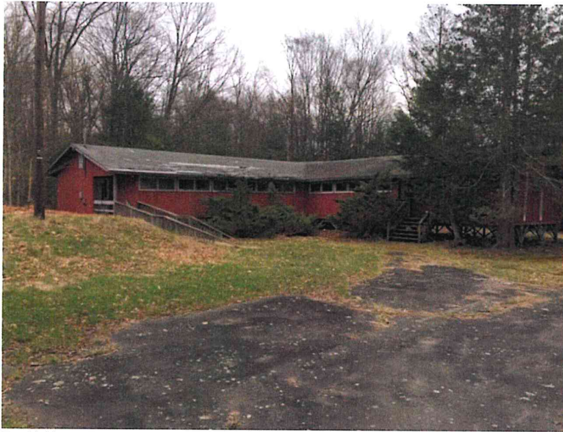
Building #28 Big Red – Last House