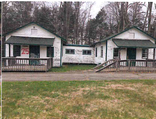
Building #25 Jaguar & Jumano