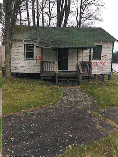
Building #18 Mohegan