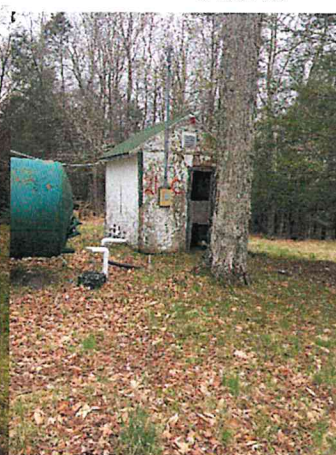
Building #21C Water pump House