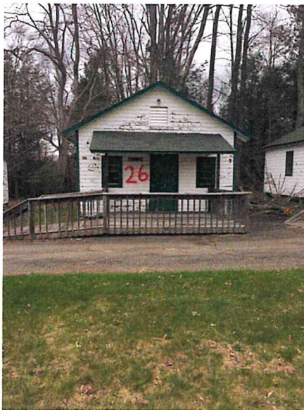
Building #26 Kutenai