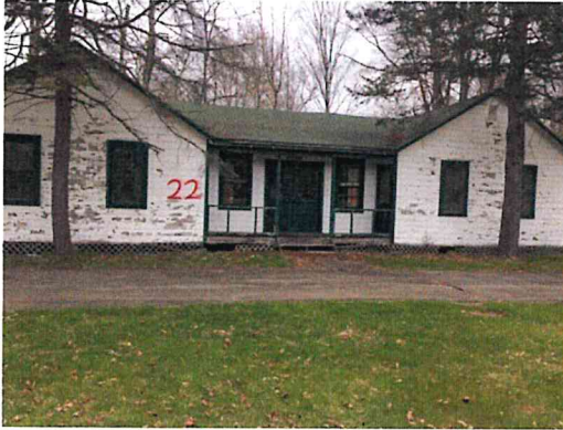
Building #22 Gihochimee