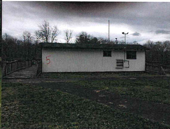
Building #5 Pool Office