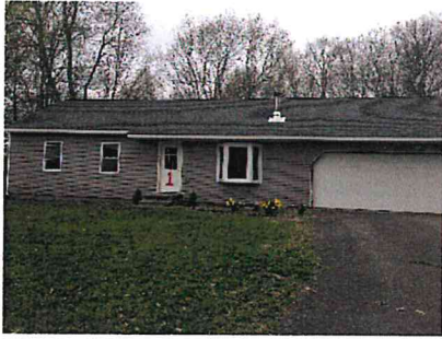
Main House Building #120 +