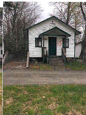
Building #15 Delaware