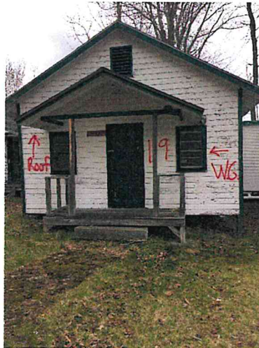
Building #19 Navajo