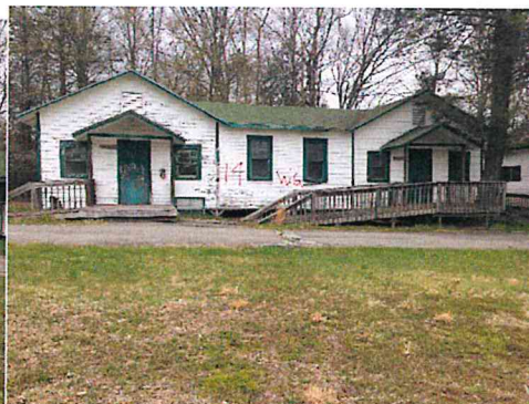
Building #14 Cherokee & Choctaw