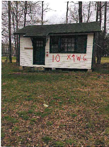
Building #10 Cabin #4