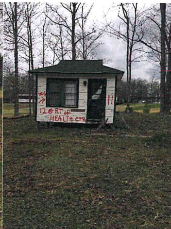
Building #11 Cabin #5