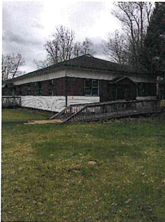
Building #4 Rec Hall