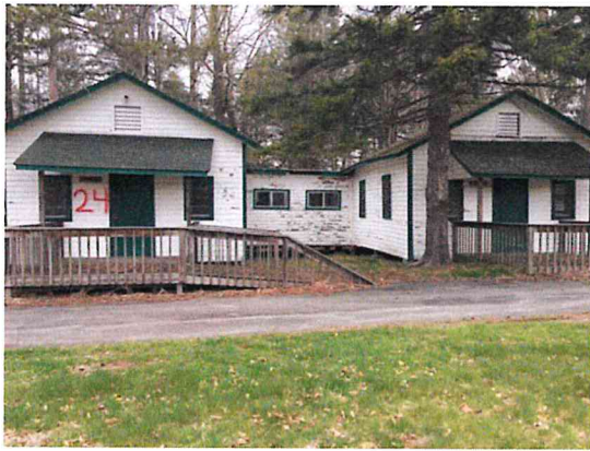
Building #24 Illinois & Inca