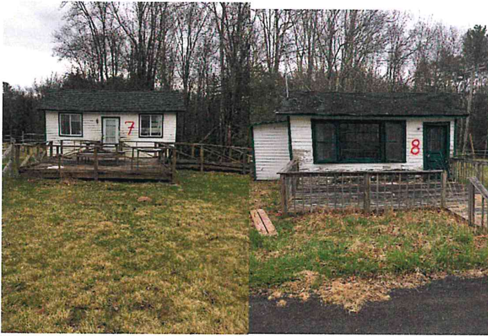
Building #7 House by Water