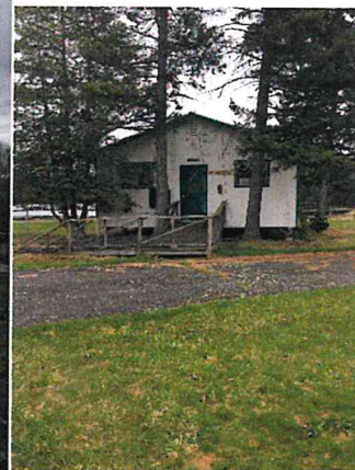
Building #6 Arts & Crafts