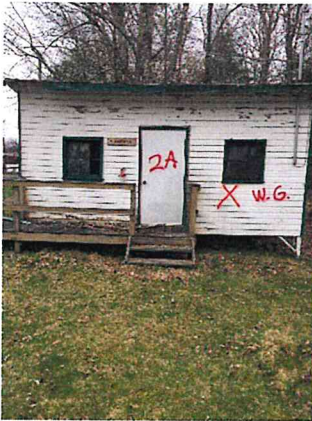
Building 2A Sensory Building