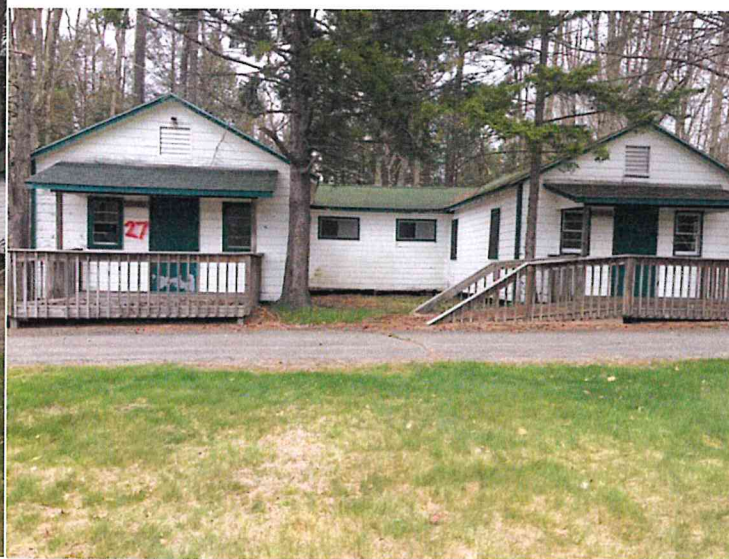
Building #27 Llano & Lynx