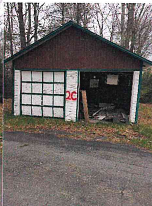
Building 2C Small Garage