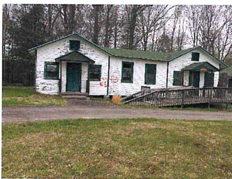
Building #13 Blackfoot