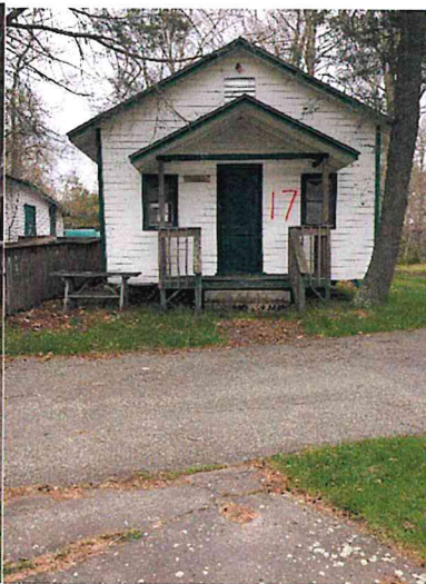
Building #17 Fox