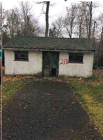
Building #21B Laundry