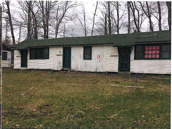
Building #9 Cabin #1, #2 and #3