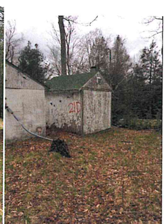
Building #21D Heating