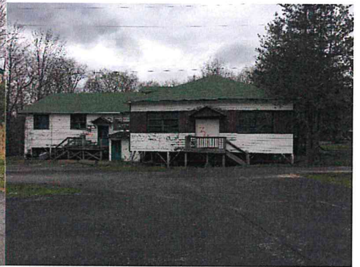
Building #3 Dining Hall