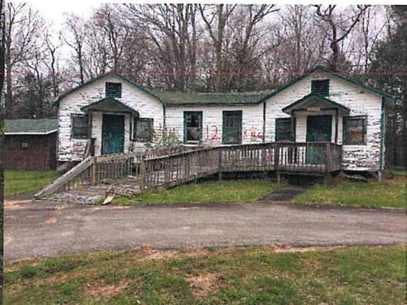
Building #12 Apache